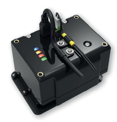
ADR100 rear view, showing lighting indicators and cable connections